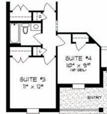
OPTIONAL SUITE #4